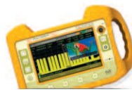
HD RANGER Eco