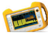
RANGER Neo Lite