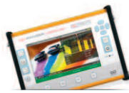
HD RANGER UltraLite