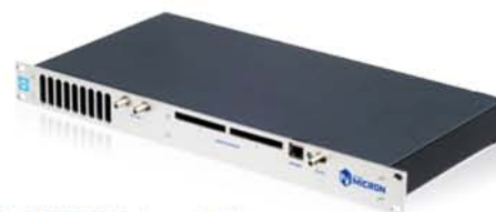
MyM Pro MICRON 3 also available